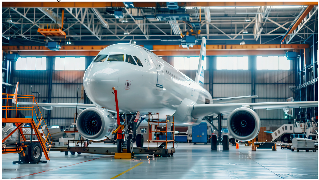
Towns and cities at the cutting edge of aeronautics

Toulouse, Paris, Bordeaux, and Marignane (near Marseille), as well as Aix-en-Provence, Nantes and Saint-Nazaire are locomotives for the French aeronautical sector and contribute to the country's technological excellence in this field, as well as the global competitiveness of French industry: ? Toulouse: Europe's aeronautical capital is home to the headquarters of Airbus and is a hub for aeronautical engineering and production. The Aeromart Toulouse trade show is the world's biggest business event dedicated to aeronautics in terms of number of visitors, attendees and B2B meetings.