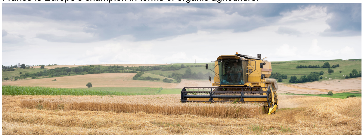
Lyon, Rennes and Paris: leading French cities in the food production sector

In addition, the country's agricultural products are renowned for their quality and their respect for strict health and environmental standards, which enhance their attractiveness in international markets. Attentive to the need to preserve the environment and make a commitment towards sustainable production, France, in its capacity as the leading agricultural power in the European Union, has also shown itself to be the driving force behind organic food production in Europe. With 10.4% of workable agricultural land designated as organic in 2023 and 14.4% of French farms committed to organic farming, France is Europe's champion in terms of organic agriculture.